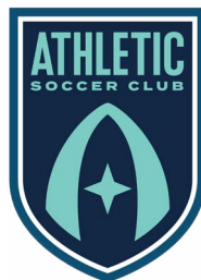
Athletic Soccer Club www.athleticsoccerclub.org 4 - 9