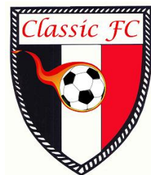
Classic Futbol Club www.classicfc.net 10 - 14